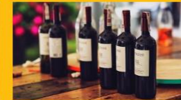
Cantine Due Palme - Italy