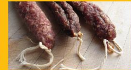
Argal - Spain