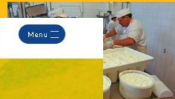
ovanni - Italy